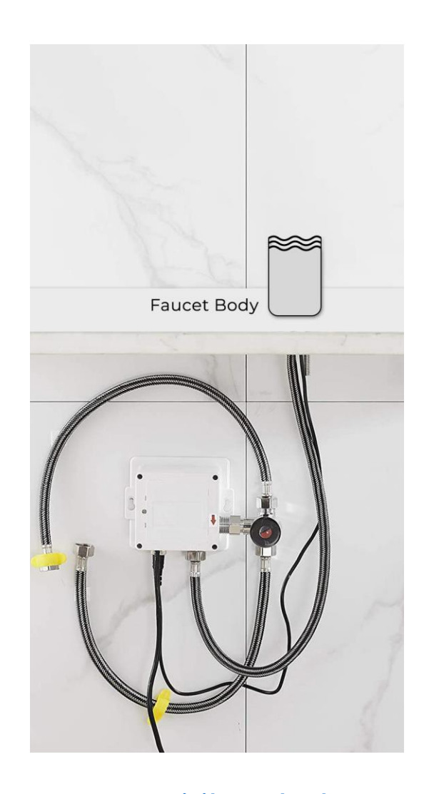
Visit product Page